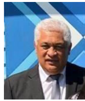
Patriarch Matenga Hapi